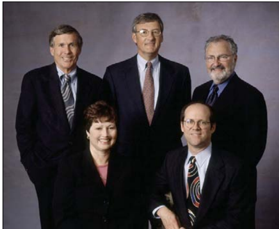
Kirsch Foundation Board and Officers: